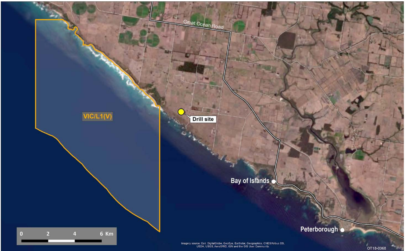
Map showing Halladale, Black Watch and Speculant well site.