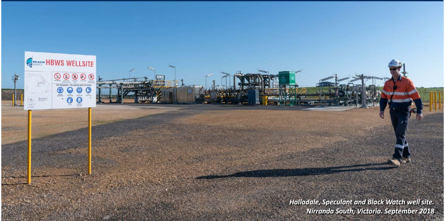
Halladale, Speculant and Black Watch well site, Nirranda South, Victoria. September 2018